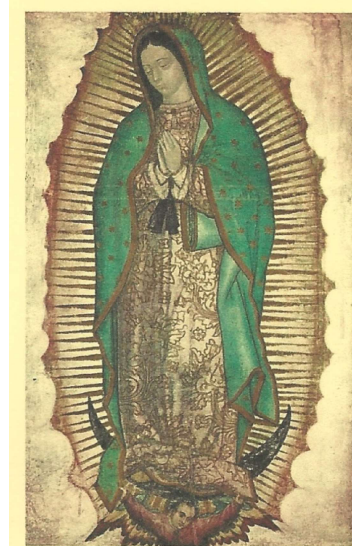
St. Juan Diego's tilma imprinted with Our Lady of Guadalupe.

Please note: Events and programs are still being finalized. Plans will be published on the parish website www.ihmparish.com as they are finalized. Be sure to check there for the latest updates.