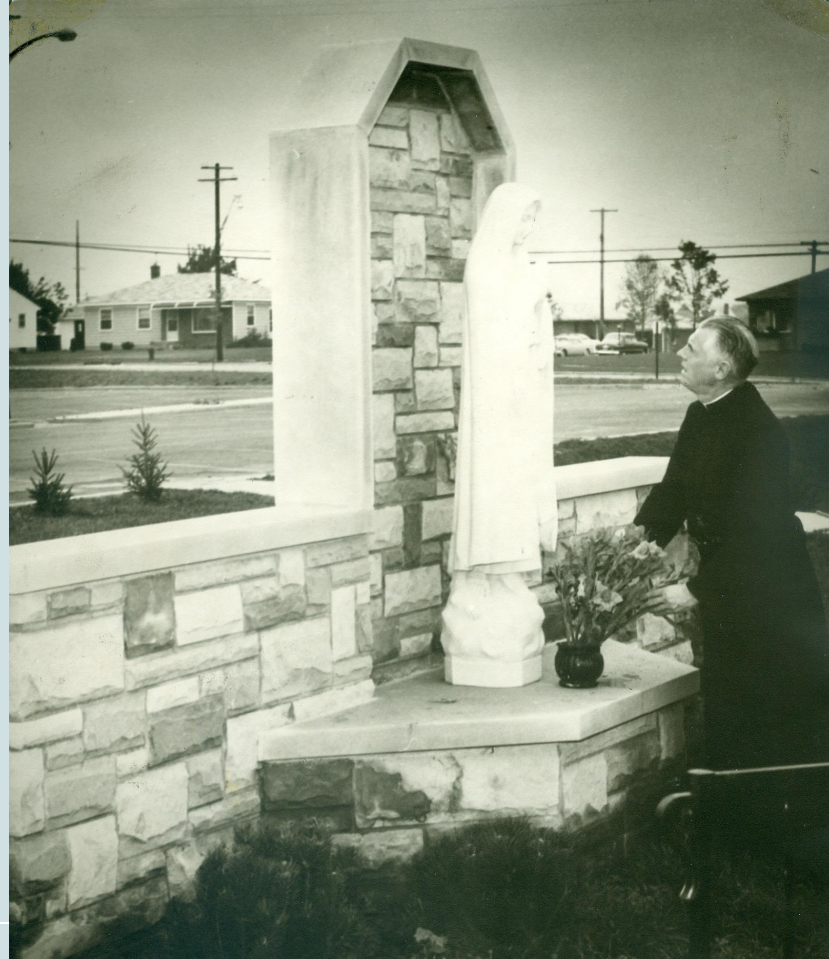
This statue of Mary formerly stood near today's entry to the Parish Center. This photo was taken around 1958.