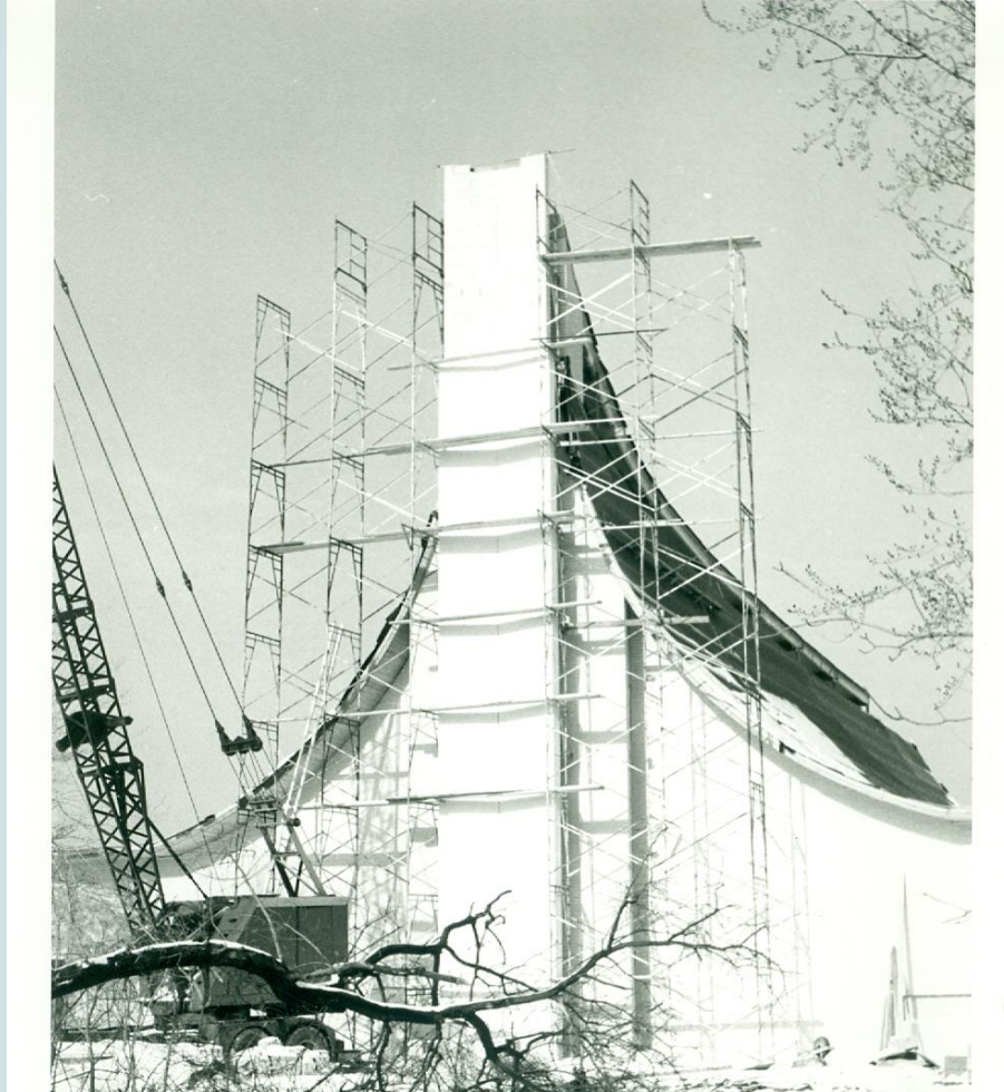
The front of our church during construction, 1965-'66.