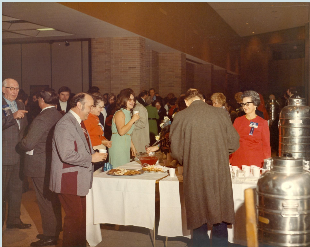
After Mass, parishioners celebrated our 25th parish anniversary with a party held in the Ottawa Hills High School “Mall” area.