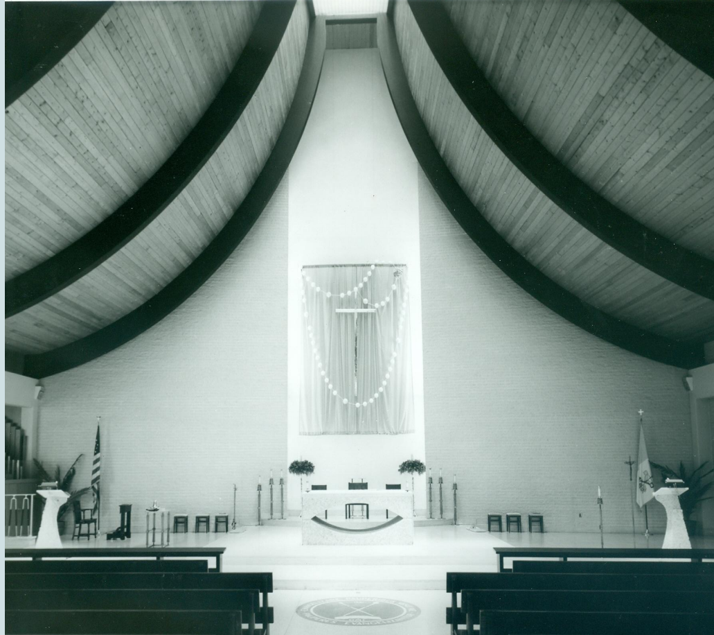
A view of the church interior, 1972. The “Risen Christ” was purchased in Italy and added to the wall behind the altar two years later.