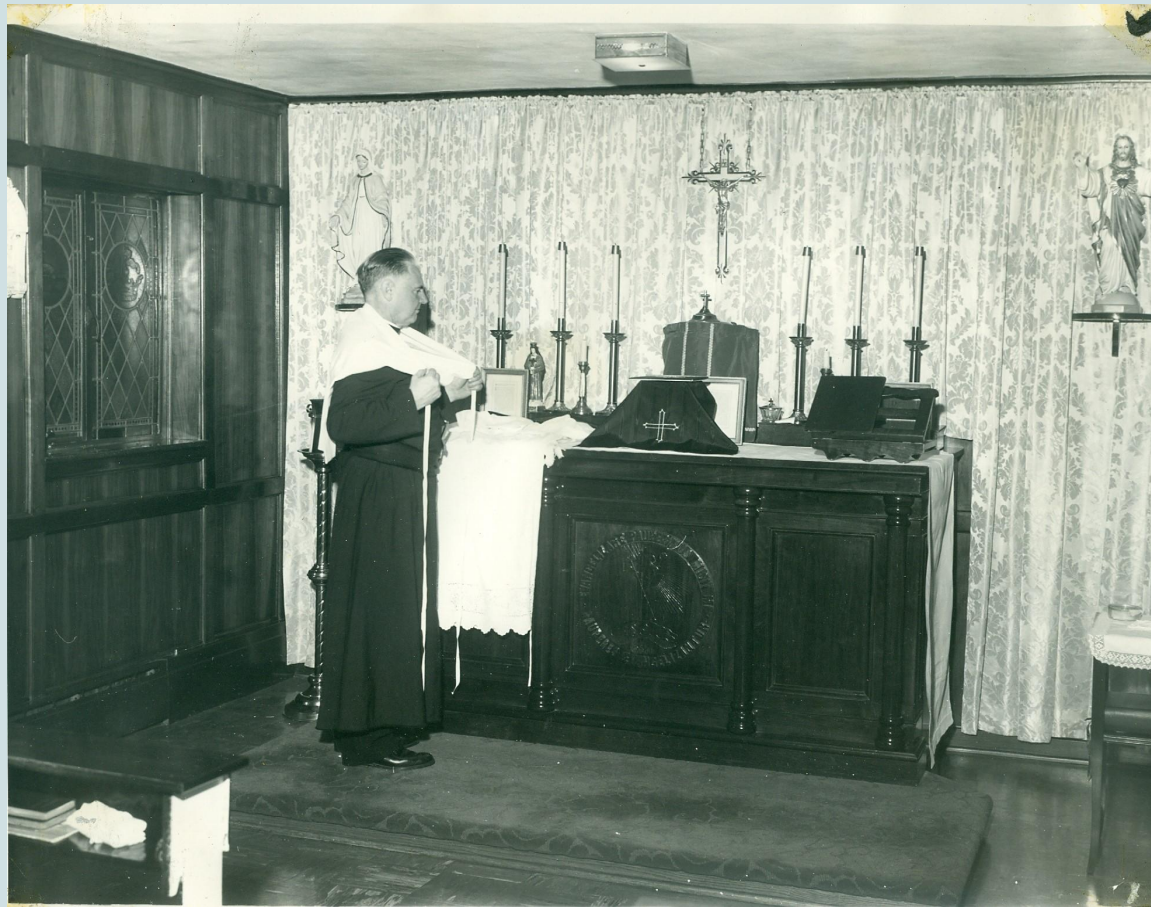
Soon the rectory, including this chapel, was constructed. This first rectory is now the preschool building.