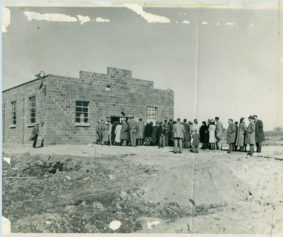
The first “temporary” Immaculate Heart of Mary Church was erected in 1949.