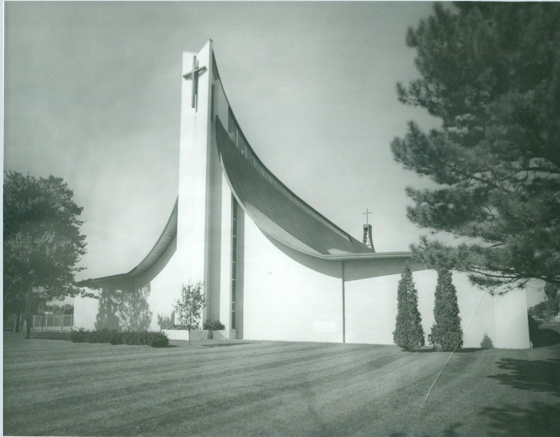
Finished exterior of Immaculate Heart of Mary Church as it looked in 1966.