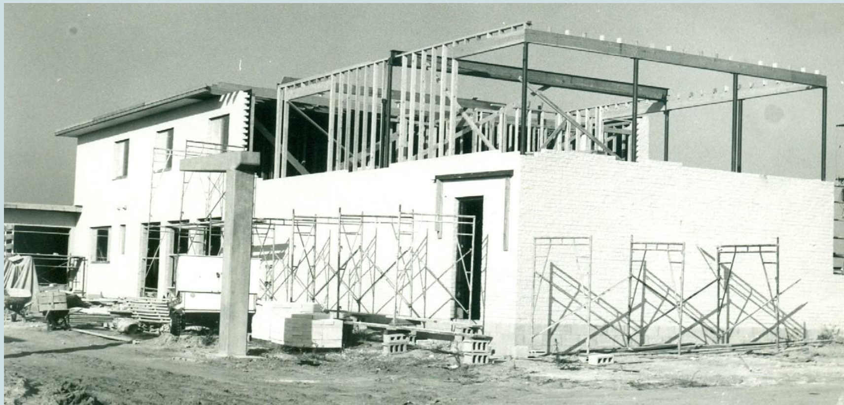
This is a view of the new rectory during construction, 1966.