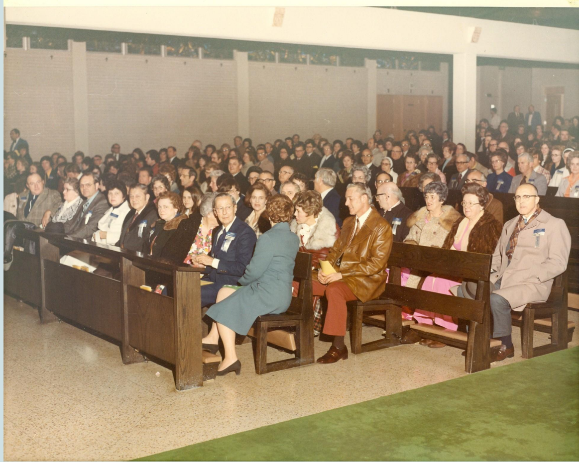
In 1974, we celebrated the 25th anniversary of IHM Parish.